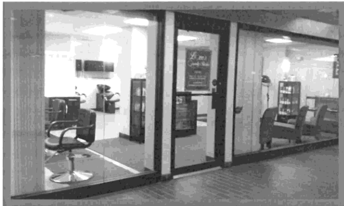
Love' s Beauty Studio, Pittsfield