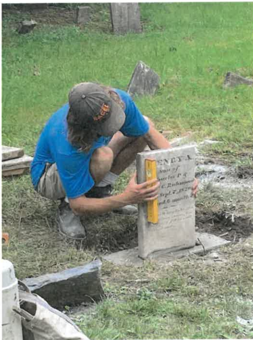
Staff from Monument Conservation Collaborative works to set a cleaned marker.