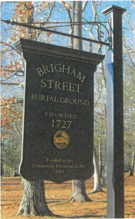
An example of the historically appropriate sign that is proposed to be set outside of the cemetery, along West St.