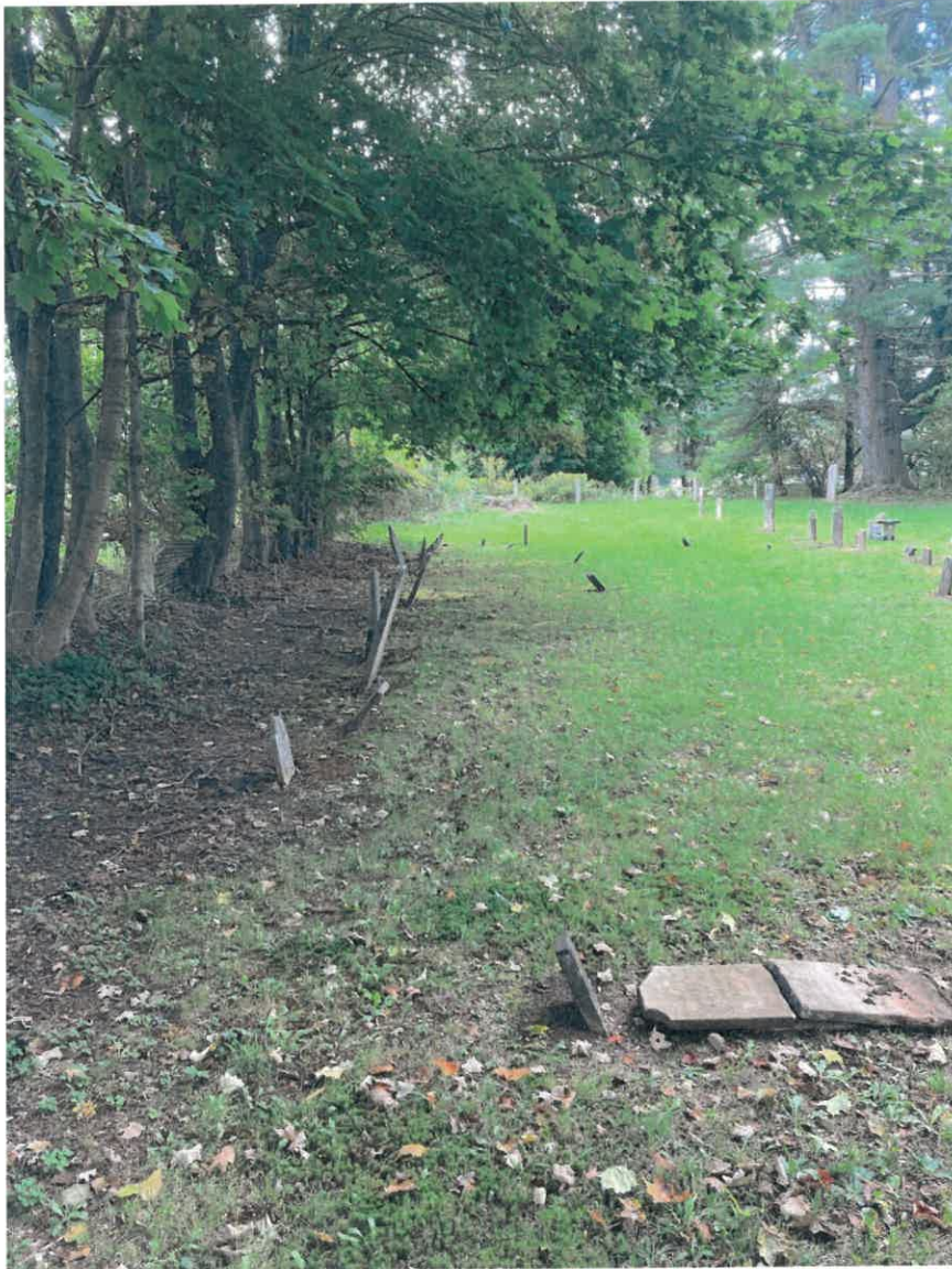
The remaining priority 16 markers that need to be reset sit along the eastern and rear edge of the cemetery.