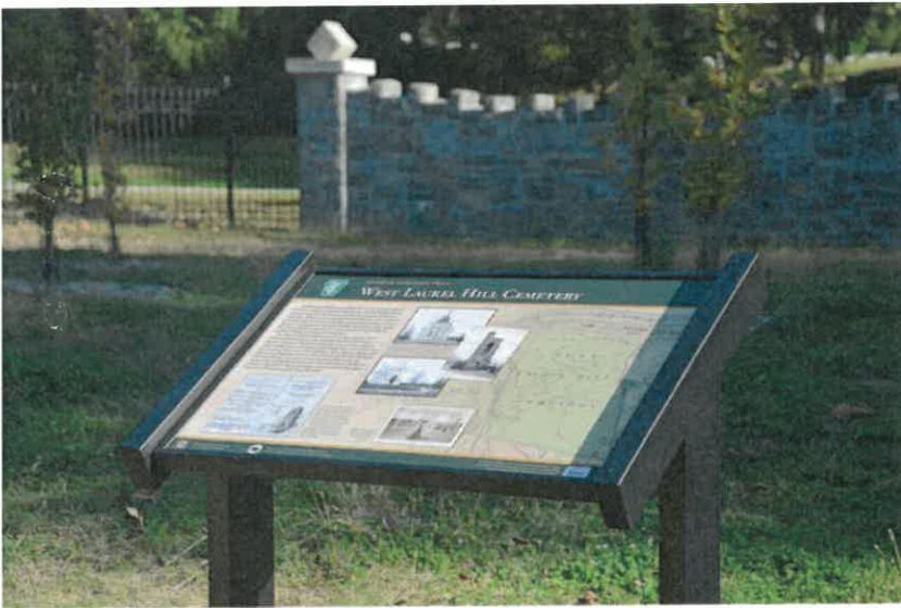
An example of the type of interpretive sign that would be set near the entrance to the Cemetery.