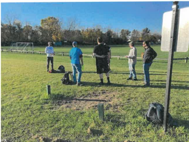
The course is well-used by the local disc golf community.