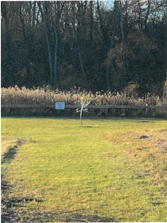
Basket at Hole 5 is badly damaged from vandalism.