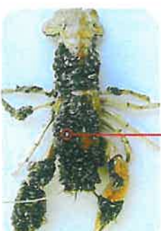
Ontario Ministry of Natural Resources