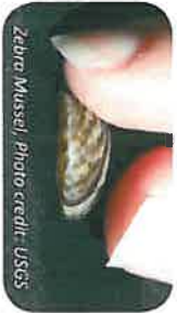
Zebra Mussel

Massachusetts' lakes, ponds, and streams are a valuable resource for boating, swimming, fishing, and numerous other types of recreation. These water bodies also provide valuable habitat for a variety of wildlife, including a number of popular sport fish species. Unfortunately, the looming invasion of our waters by exotic mussels threatens to damage these resources.