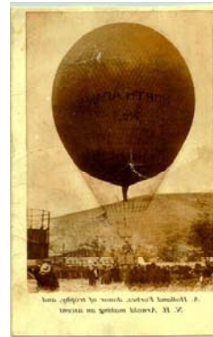
History: Balloons in N. Adams

An example of the style that BCAC is seeking is the Hudson River School, which was a mid 19 th century American Art Movement embodied by a group of landscape painters whose aesthetic vision was influenced by romanticism. Examples of Hudson River Artists appear below.