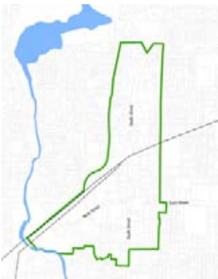
Downtown Arts Overlay District boundaries