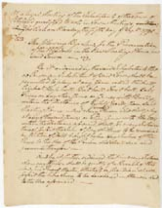
1791 Town Bylaw banning baseball among other things in Pittsfield.

York. It lies 45 miles east of Albany, 80 miles from Hartford, 135 miles from Boston and 150 miles from New York City.