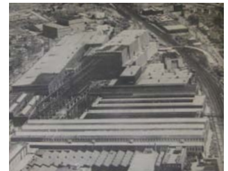
General Electric's transformer business boomed in Pittsfield during the middle decades of the 20th Century.

Economic development in the 21st century has taken on an added dimension. First, the trend towards smaller business continues. According to the U.S. Small Business Administration 97.5 percent of firms have fewer than 20 employees – and those firms have generated up to 80 percent of new jobs over the past decade. As the “Heart of the Berkshires”, Pittsfield has become an increasingly desirable place to live, work, and play and offers